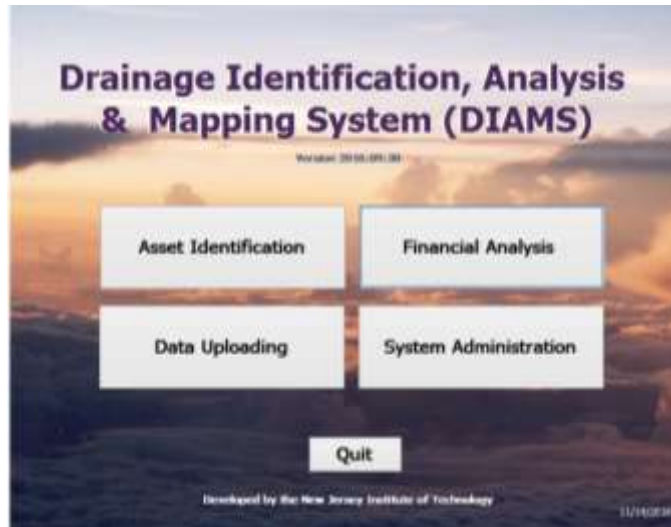
Figure 1. Main Form

The Asset Module interfaces consists of a main switchboard, and four sets of data review/edit forms as shown in Figure 2. In addition to the main switchboard, the Asset Module interfaces contain several functional submodules, each of which are discussed below.